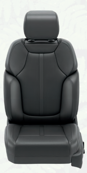
Ventilated Nappa Leather-Trimmed Seat with Axis II Perforations and Global Black/Smoke Accent Stitching – Global Black (Standard)