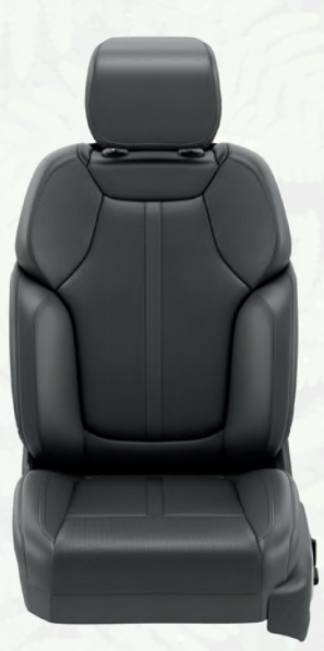
Ventilated Nappa Leather-Trimmed Seat with Axis II Perforations and Global Black/Smoke Accent Stitching – Global Black (Standard)