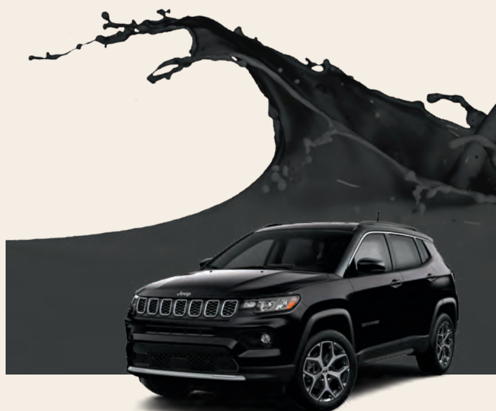
Diamond Black Crystal Pearl