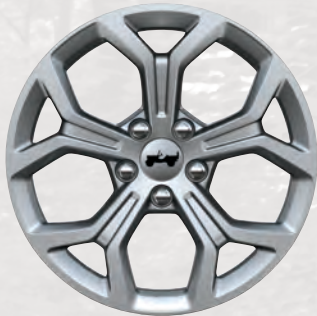
17-inch Fine Silver-painted aluminum wheels (standard)