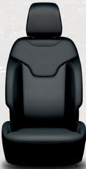
McKinley leather-faced seats with Steel Grey accent stitching — Black/Grey and Black/Sepia (standard)

DRIVER ASSISTANCE GROUP I: Wireless charging pad, 10.25-inch, digital, full-colour DID, Adaptive Cruise Control with Stop and Go, 10 Park-Sense Front and Rear Park Assist System, 10 360° Surround-View Camera System, 14 Parallel and Perpendicular Park and Unpark Assist System, 10 Traffic Sign Recognition 15 and Highway Assist System 16