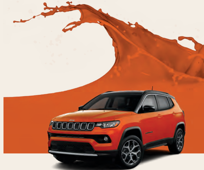
Joose (limited availability)