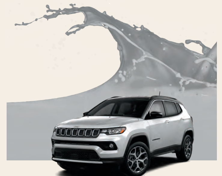
Silver Zynith Metallic