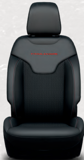
McKinley leather-faced and Spectre cloth seats with embroidered Trailhawk® logo and Ruby Red and Tungsten dual accent stitching — Black (standard)

TRAILHAWK® ELITE: Uconnect 5 NAV Infotainment System with 10.1-inch touchscreen, LED low- / high-beam projector headlamps, premium LED taillamps and fog lamps, 10.25-inch, digital, full-colour DID, power-adjustable driver's and front-passenger seats, leather-faced seats, driver's-seat memory, ventilated front seats, Trailer Tow Group, wireless charging pad, Adaptive Cruise Control with Stop and Go¹⁰, Highway Assist System¹⁶, Traffic Sign Recognition¹⁵, Park-Sense Front and Rear Park Assist System¹⁰, reversible carpet / vinyl rear cargo mat, 360° Surround-View Camera System¹⁴, and Parallel and Perpendicular Park and Unpark Assist System¹⁰