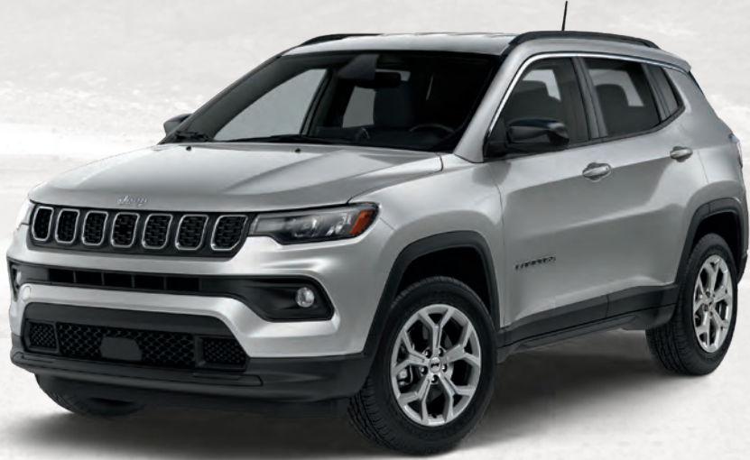
North in Silver Zynith Metallic