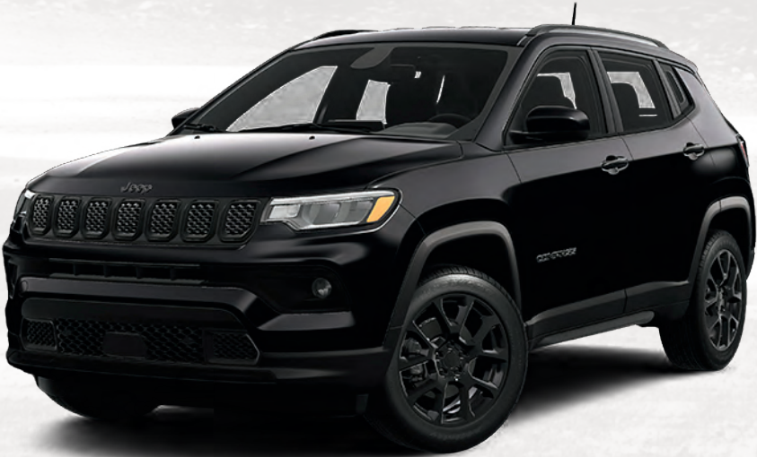
Altitude Special Edition in Diamond Black Crystal Pearl