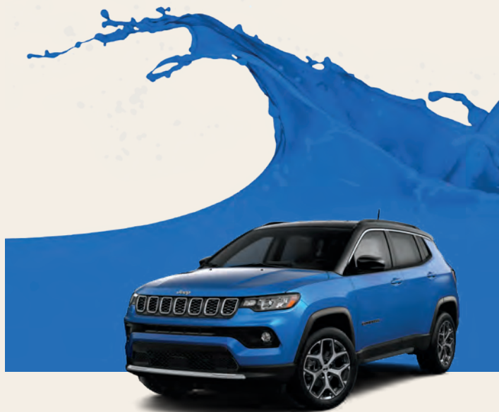
Hydro Blue Pearl