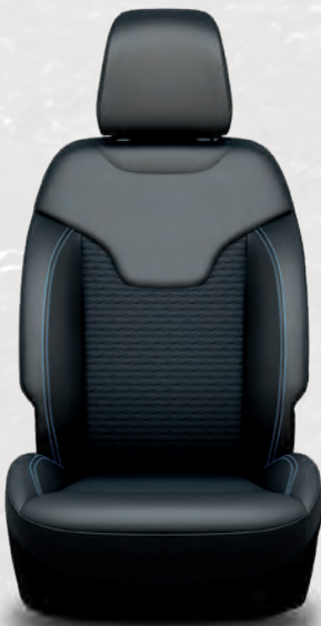
McKinley vinyl and Kimberlite cloth seats with Bright Blue accent stitching — Black (standard)

ALTITUDE SPECIAL EDITION: Piano Black interior accents, Neutral Grey exterior badging, Black grille with Neutral Grey rings, Black DLO mouldings, 10.25-inch, digital, full-colour DID, Uconnect 5 NAV Infotainment System with 10.1-inch touchscreen, power driver's seat, Black Addax vinyl-wrapped instrument panel mid-bolster, Light Tungsten interior accent stitching, 18-inch Gloss Black-painted aluminum wheels and 225 / 55R18 BSW All-Season tires