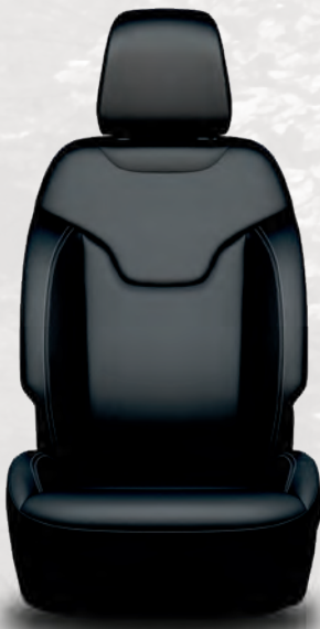
Ventilated McKinley leather-faced seats with Bright Blue accent stitching — Black/Grey (available with Elite Group)