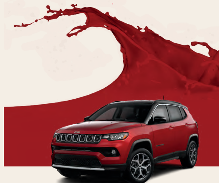
Red Hot Pearl