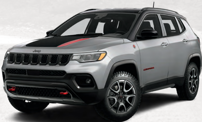
Trailhawk® in Silver Zynith Metallic