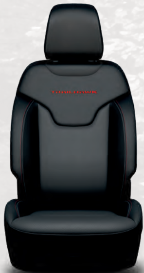
Ventilated McKinley leather-faced seats with embroidered Trailhawk logo and Ruby Red and Tungsten dual accent stitching — Black (available with Trailhawk Elite)