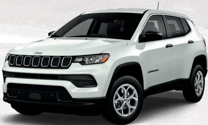
Sport in Bright White