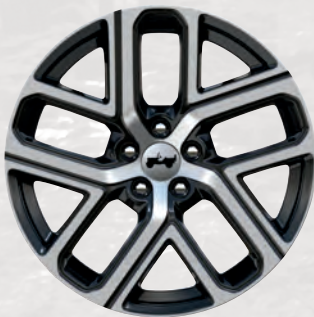
19-inch Diamond-Cut aluminum wheels with Gloss Black pockets (available with Elite Group)