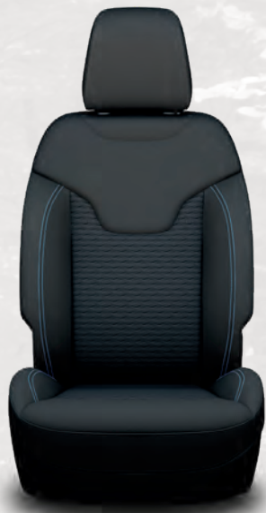
Sedoso and Kimberlite cloth seats with Bright Blue accent stitching — Black (standard)