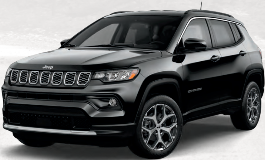
Limited in Diamond Black Crystal Pearl