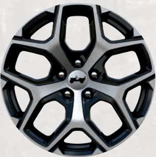
18-inch painted Diamond-Cut aluminum wheels (standard)