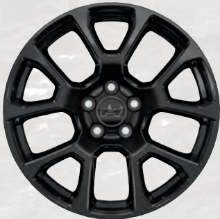
18-inch Gloss Black-painted aluminum wheels (standard on Altitude Special Edition)