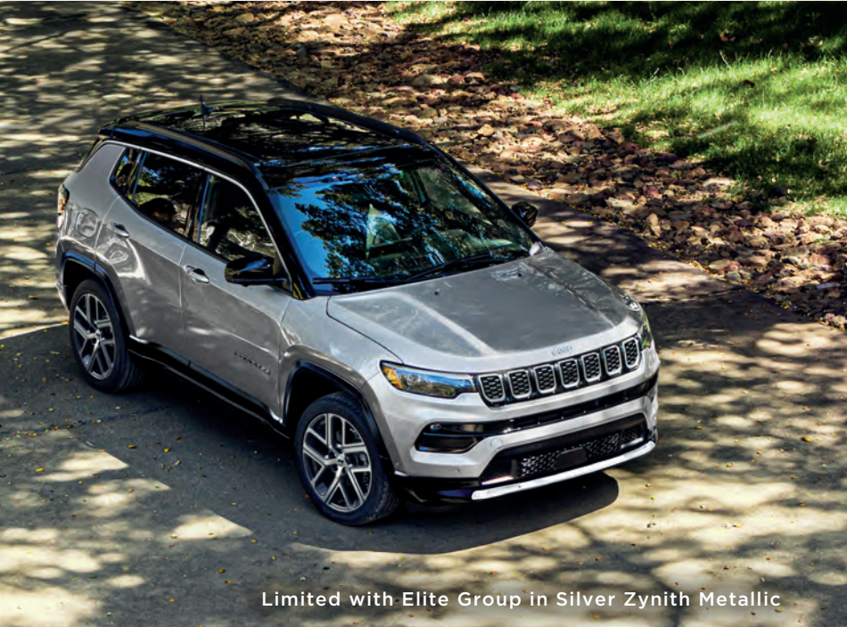
Limited with Elite Group in Silver Zynith Metallic