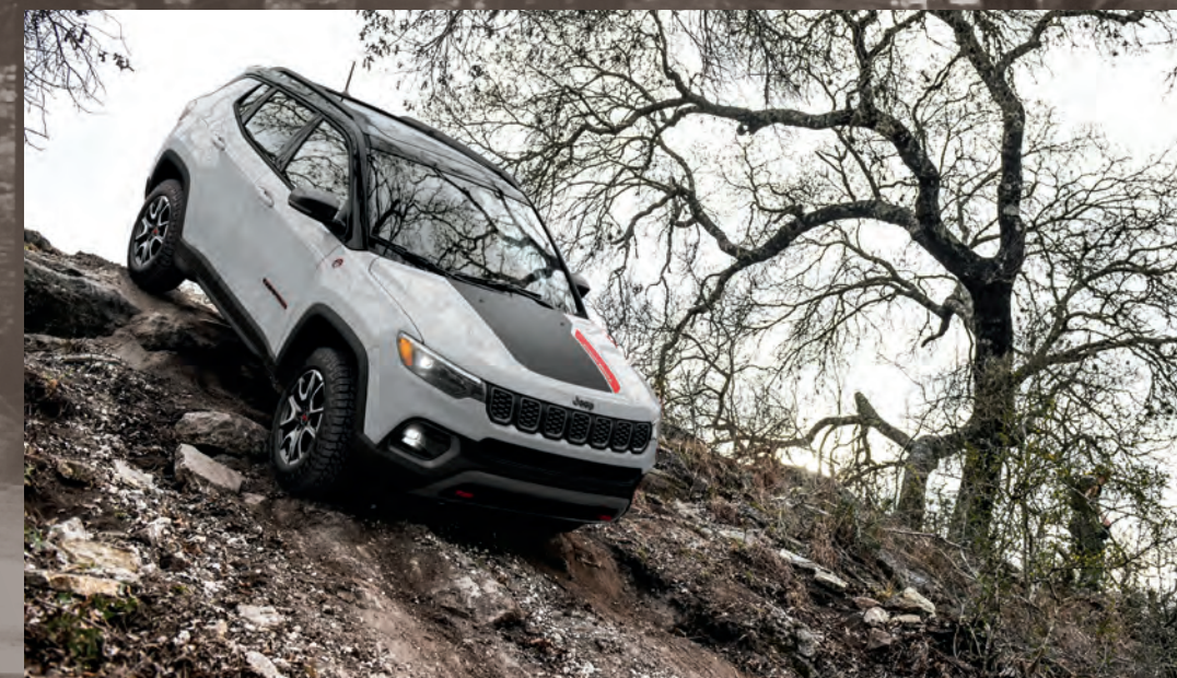
Trailhawk in Bright White