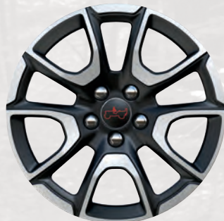
17-inch Diamond-Cut aluminum wheels with Satin Black pockets (standard)