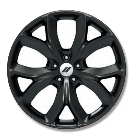
20-inch Abyss Finish // WHN (Included with Track Pack)