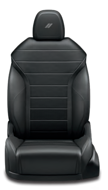
Perforated Leather Trim with Embroidered Dodge Logo and Black Stitching (Standard in Black)