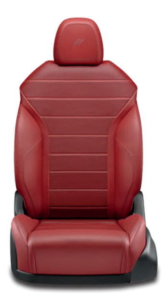
Perforated Leather Trim with Embroidered Dodge Logo and Red Stitching (Available in Red)