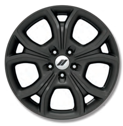
18-inch Graphite Grey // WLF (Standard)