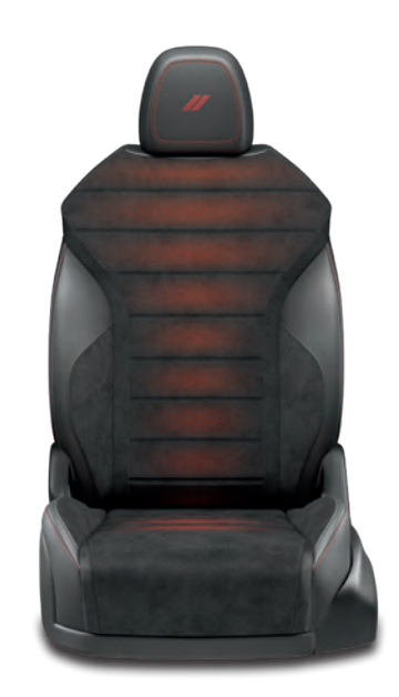
Perforated Alcantara® with Red Backing and Black Scuba Shark Bolsters with Red Accent Stitching (Included with Track Pack in Black)