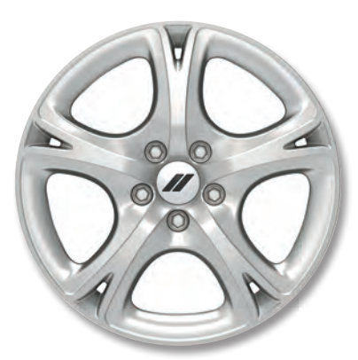
17-inch Silver // WEF (Standard)