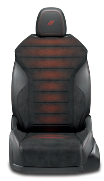
Perforated Alcantara® with Red Backing and Black Scuba Shark Bolsters with Red Accent Stitching (Included with Track Pack in Black)