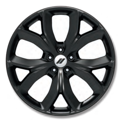
20-inch Abyss Finish // WHN (Included with Track Pack)