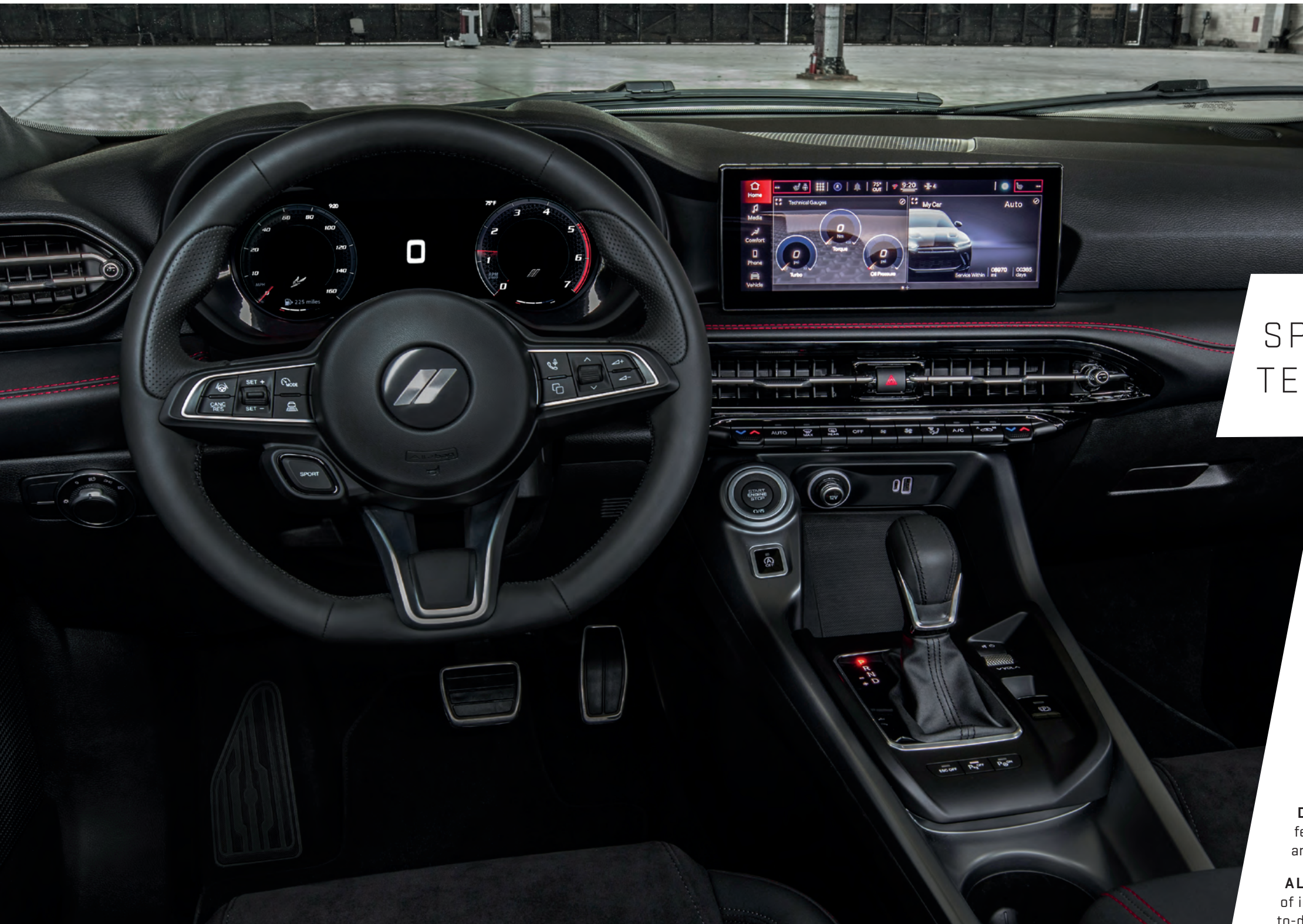
// GT Plus with Black Perforated Alcantara® Seats with Red Backing and Black Scuba Shark Bolsters with Red Accent Stitching.