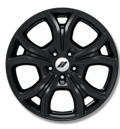
18-inch Abyss Finish // WHG (Included with Blacktop Package)