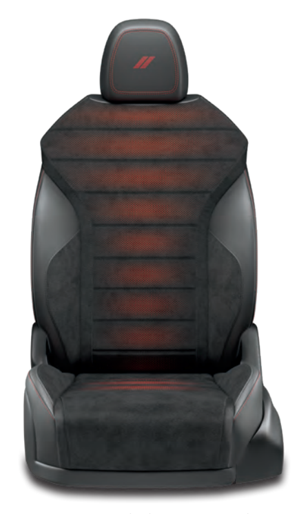
Perforated Alcantara® with Red Backing and Black Scuba Shark Bolsters with Red Accent Stitching (Included with Track Pack in Black)