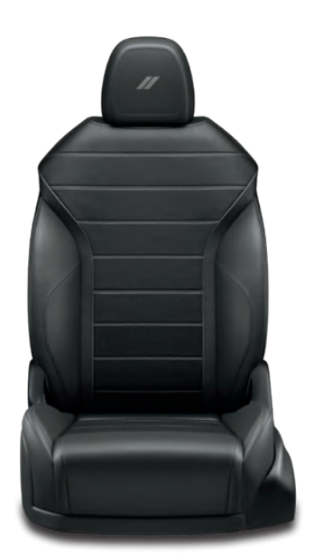
Perforated Leather Trim with Embroidered Dodge Logo and Black Stitching (Standard in Black)