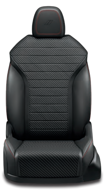
Cloth/Leatherette with Red Accent Stitching (Standard in Black)