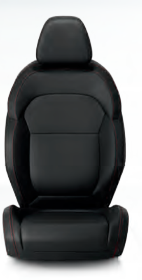
Capri Leatherette with Axis II perforated inserts and Red accent stitching. Black. Available with Plus Group