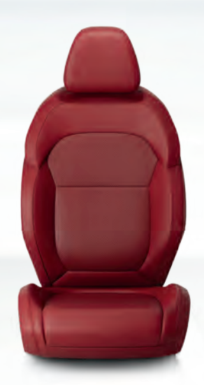
Capri Leatherette with Axis II perforated inserts and Red accent stitching. Demonic Red/Header Red. Available with Plus Group