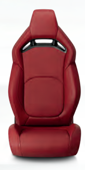
Capri Leatherette with Suede perforated inserts and Red accent stitching. Available in Black or Demonic Red/Header Red. Available with Track Pack