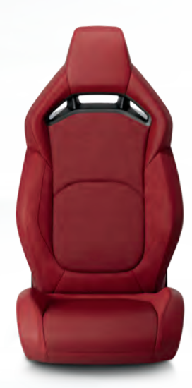
Nappa Leather outer bolsters and Suede inner bolsters and Live Wire Embossment with Axis II Suede inserts with Header Red/Red accent stitching. Available in Black or Demonic Red. Available with Carbon & Suede Package