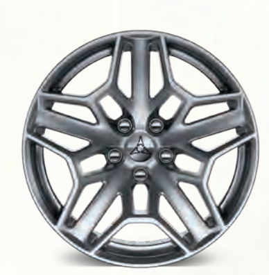
20 by 11-inch Satin Carbon // (WS5) Standard