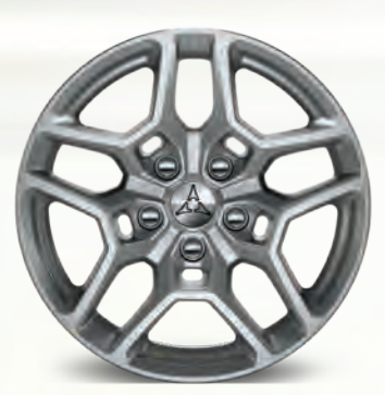
18 by 8-inch Tech Silver // (WBD) Standard