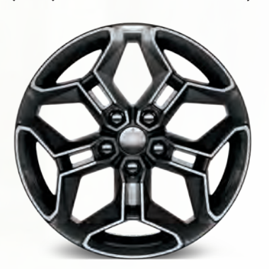
20 by 10-inch Black Noise // (WRS) Included with Plus Group and Blacktop Package