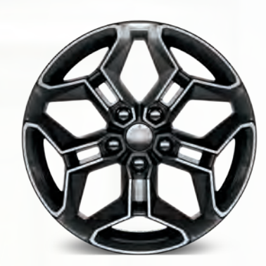
20 by 9-inch Diamond-Cut Baltic Grey // (WRT) Available with Plus Group