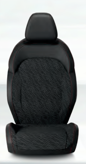
Capri Leatherette bolsters with Rift Fabric inserts with Header Red/ Red accent stitching. Black. Standard