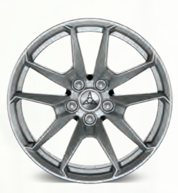
20 by 11-inch/11.5-inch Satin Carbon // (WC1) Included with Track Pack