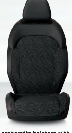
Leatherette bolsters with Rift Fabric inserts with Header Red/Red accent stitching. Black, Standard