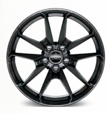
20 by 11-inch/11.5-inch Luster Grey // (WC5) Included with Track Pack and Carbon & Suede Package