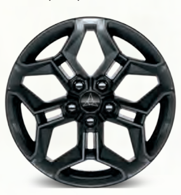
20 by 9-inch Black Noise // (WRN) Available with Blacktop Package