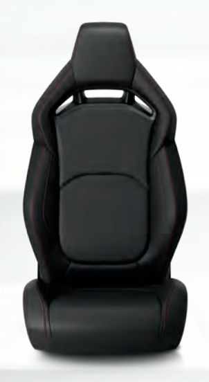
Capri Leatherette with Axis II perforated inserts and Red accent stitching. Available in Black or Demonic Red/Header Red. Available with Plus Group